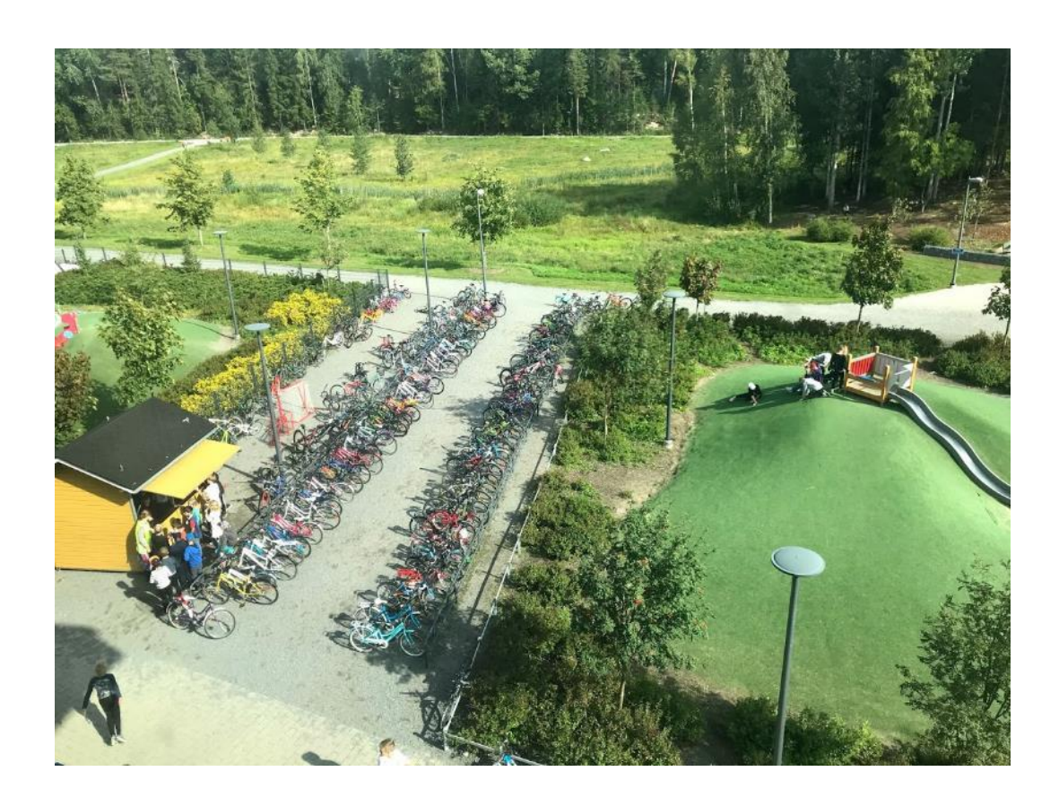
Strong connection to the local environment – Finland