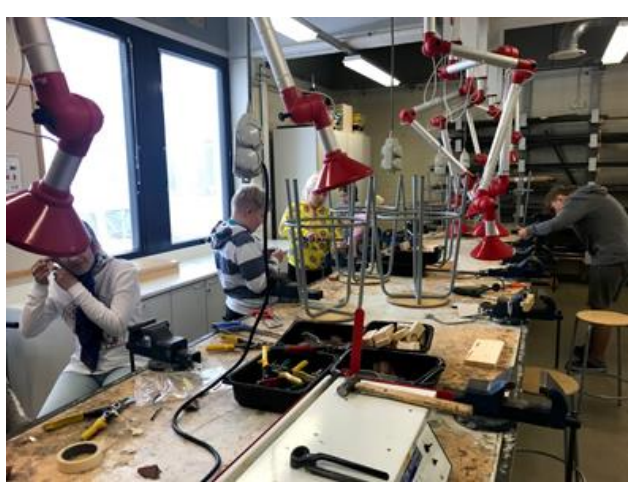
Hands on construction - Finland