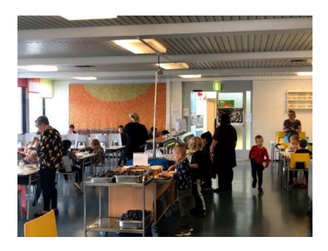
Lining up for lunch in a Finnish School

https://www.oph.fi/download/146428_Finnish_Education_in_a_Nutshell.pdf