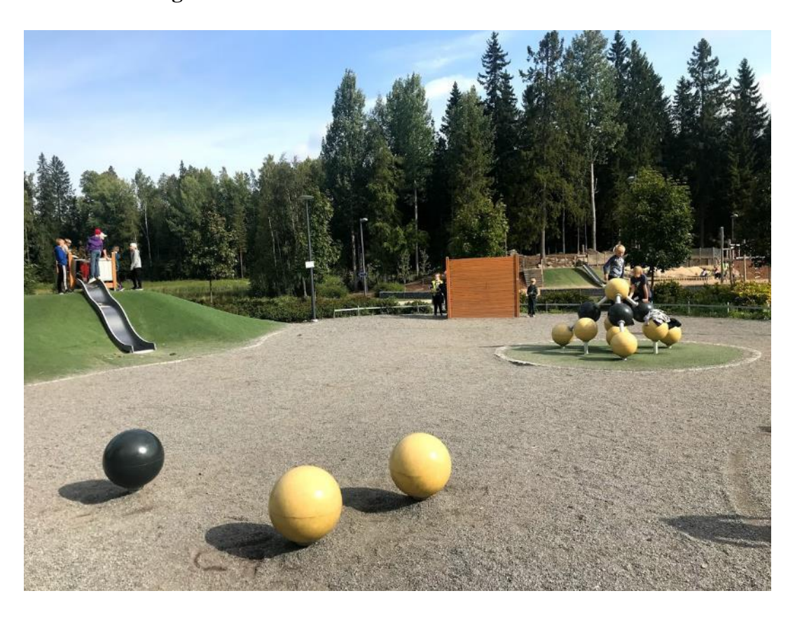
Being 'outdoors' and close to nature is important - Finland